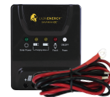
SAVANNA CCT™ Solar Charge Controller