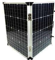
LION 100™ 100W Folding Solar Panel